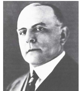
Otto Preager US Postal Museum Photo