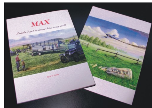
Front and back covers of "MAX...I didn't get to know him very well" .